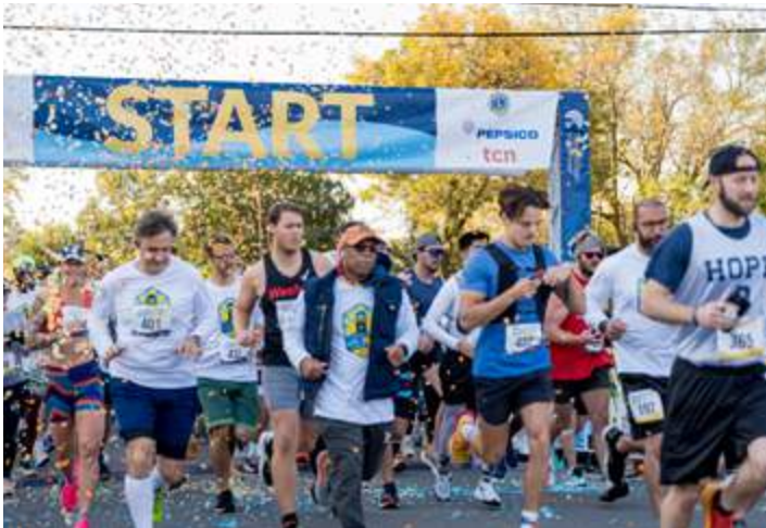
Runners and walkers of all abilities participate in our race.

Be a Champion of Accessibility! More than 26 million Americans have a disability, and when one of us is left behind, everyone is at a disadvantage. The Rise to Shine Run & Walk is an event that envisions a world without barriers to our physical and digital spaces, where everyone – regardless of ability – can be and feel fully included in their community. As a sponsor of this unique event, you are demonstrating your commitment to making our world a more inclusive, accessible and empathetic place. Proceeds from the Rise to Shine Run & Walk support programs at The Chicago Lighthouse that help people who are blind, visually impaired, disabled and Veterans build confidence and live independently.