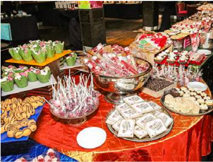
A large table in the middle of the room with endless sweets & treats covering it.