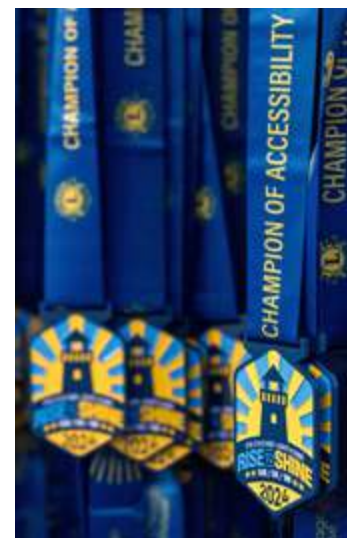
A finisher medal like no other with Braille on the back.