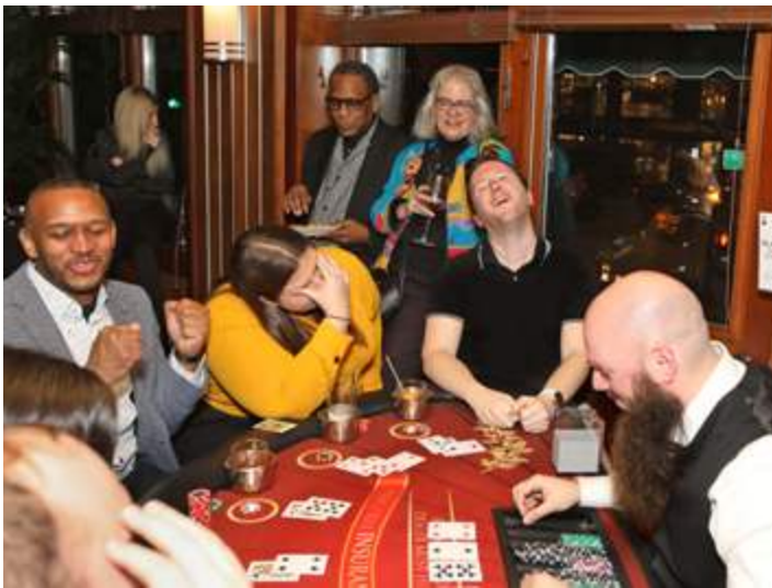
Players take their chances on a double down.

Help support our mission of providing people who are blind, visually impaired, disabled and Veterans with pathways to independence by sponsoring our high-engagement, high-excitement, high-value Poker and Casino Night. This event brings together more than 250 poker enthusiasts and other high rollers from around Chicagoland to compete in a Texas Hold 'Em tournament (with a grand prize of a seat at the World Series of Poker) and play casino games like craps, blackjack and roulette. Proceeds support The Chicago Lighthouse's many programs and services that offer job training and placement, social support and comprehensive vision services to people with disabilities and Veterans.