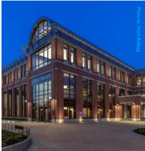
The Holtschneider Performance Center, home to the Gannon Concert Hall.