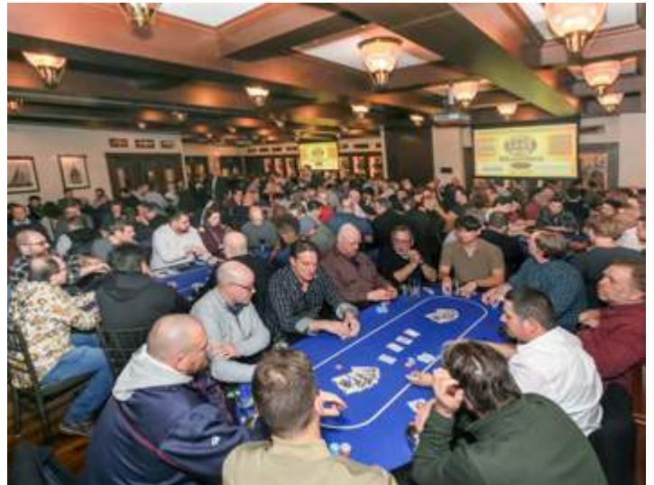
The Texas Hold 'Em Tournament always attracts a "Full House."