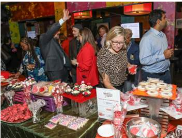
Guests enjoying the atmosphere of Carnivale while raising money for Lighthouse Children's Programs.