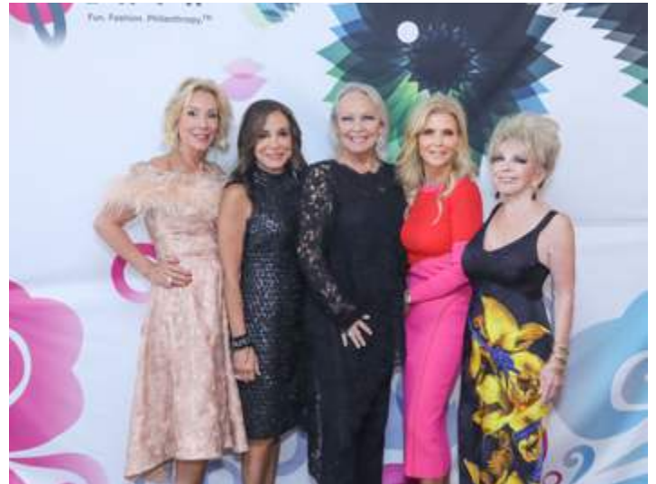
The FLAIR Committee celebrating a wonderful event!