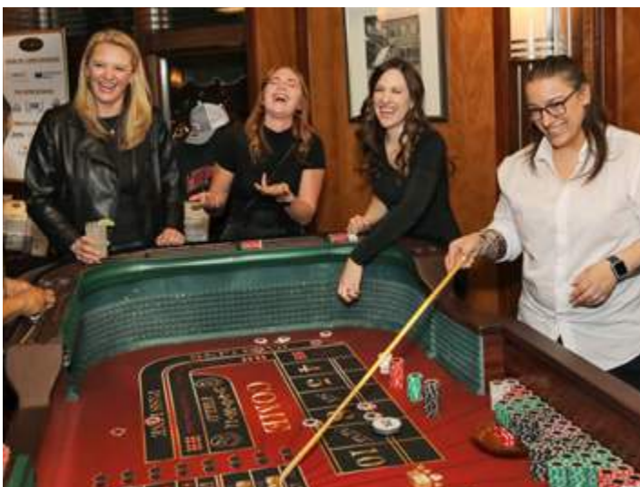
Non-poker players try their luck at craps and other casino games.