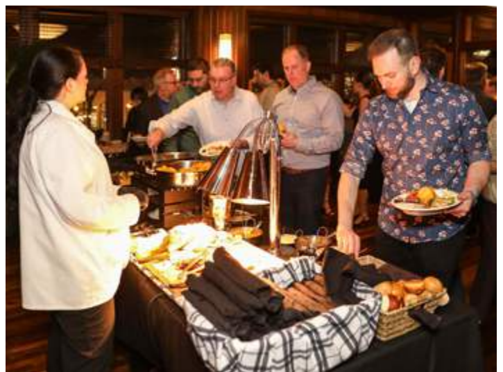
Everyone's a winner with Gibson's famous buffet.