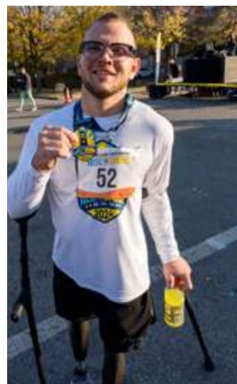
Everyone is welcome.