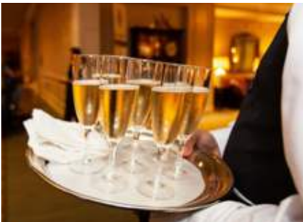
The evening begins with an elegant pre-show reception.