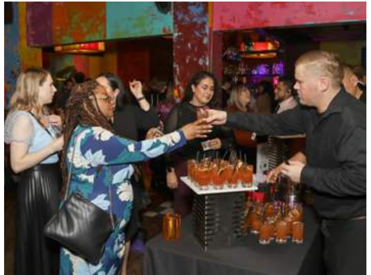
Guests enjoying one of the custom cocktails from one of the sip stations.