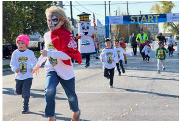
Our Fitness Fest for All includes a fun kids race.