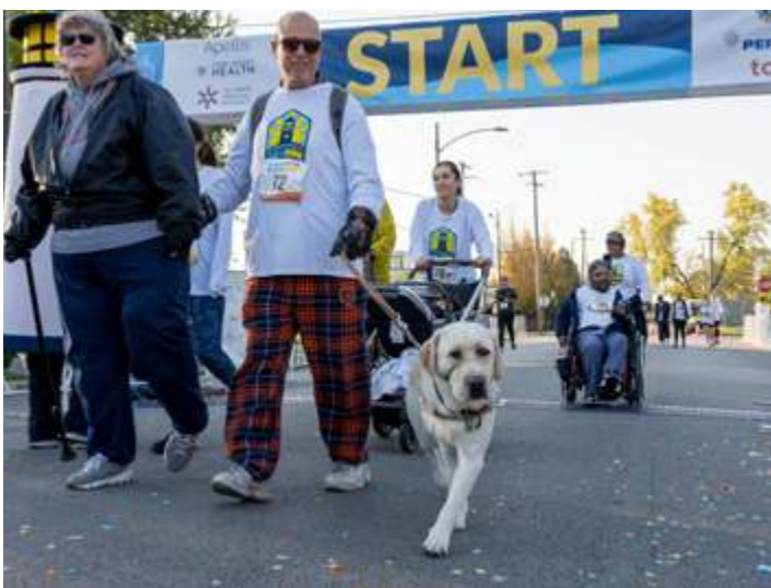
Guide dogs get their exercise too!