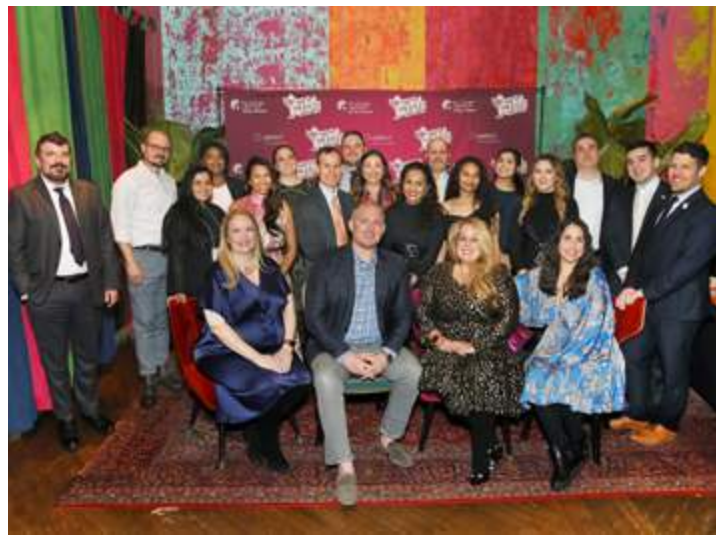
The Chicago Lighthouse Junior Board gathers for a photo together.