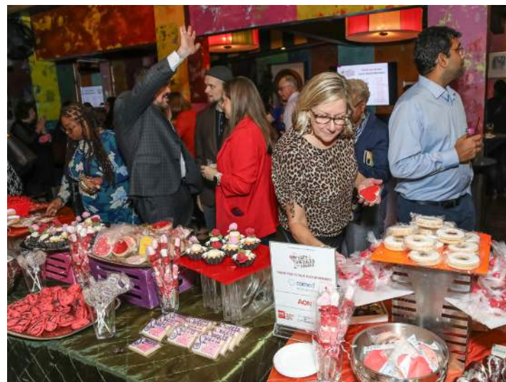
Guests enjoying the atmosphere of Carnivale while raising money for Lighthouse Children's Programs.