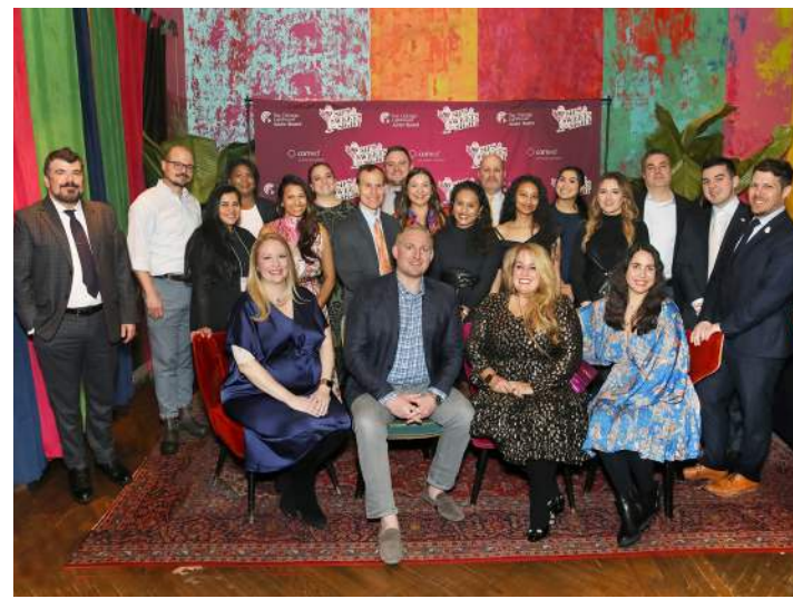
The Chicago Lighthouse Junior Board gathers for a photo together.

Detailed list of exposure opportunities on the next page