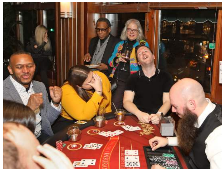
Players take their chances on a double down.

ROYAL FLUSH | $15,000 FOUR OF A KIND | $10,000 FULL HOUSE | $5,000 THREE OF A KIND | $2,500