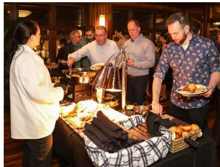
Everyone's a winner with Gibson's famous buffet.