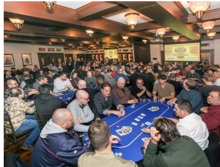
The Texas Hold 'Em Tournament always attracts a "Full House."