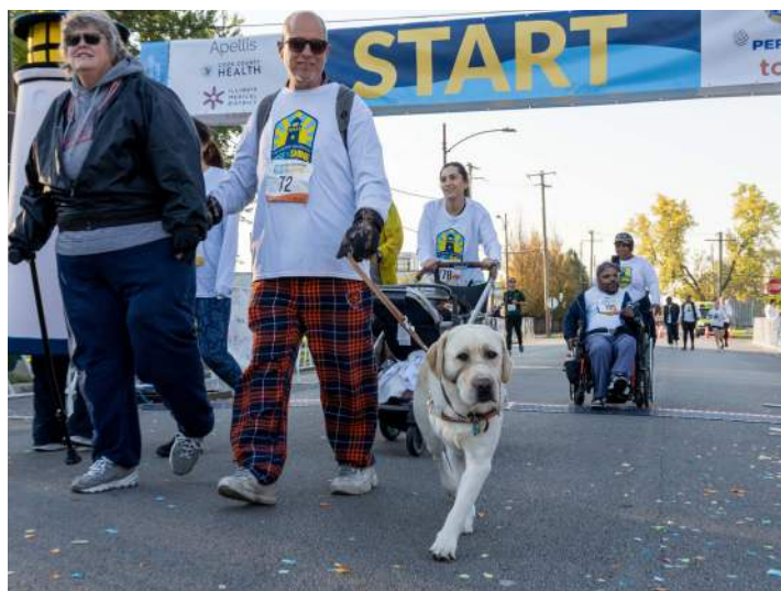
Guide dogs get their exercise too!