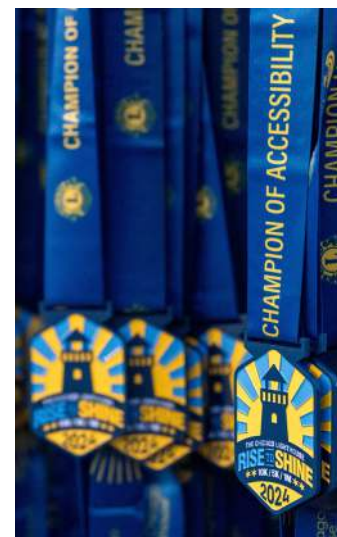
A finisher medal like no other with Braille on the back.