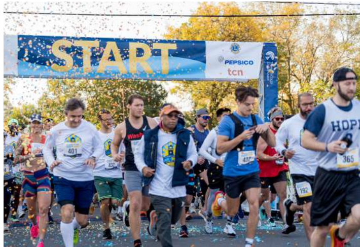
Runners and walkers of all abilities participate in our race.

Be a Champion of Accessibility! More than 26 million Americans have a disability, and when one of us is left behind, everyone is at a disadvantage. The Rise to Shine Run & Walk is an event that envisions a world without barriers to our physical and digital spaces, where everyone – regardless of ability – can be and feel fully included in their community. As a sponsor of this unique event, you are demonstrating your commitment to making our world a more inclusive, accessible and empathetic place. Proceeds from the Rise to Shine Run & Walk support programs at The Chicago Lighthouse that help people who are blind, visually impaired, disabled and Veterans build confidence and live independently.