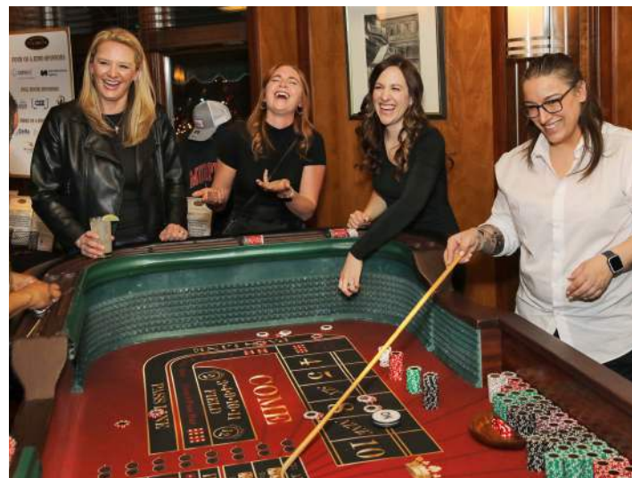
Non-poker players try their luck at craps and other casino games.