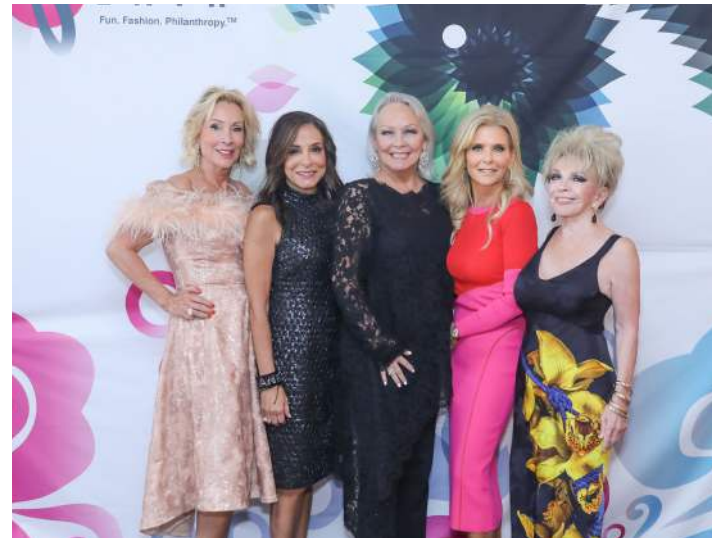
The FLAIR Committee celebrating a wonderful event!