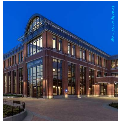
The Holtschneider Performance Center, home to the Gannon Concert Hall.