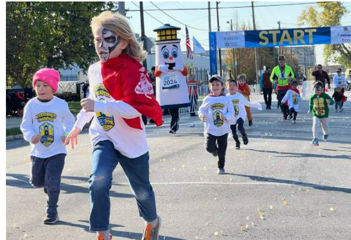
Our Fitness Fest for All includes a fun kids race.