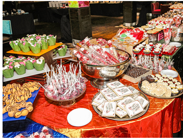
A large table in the middle of the room with endless sweets & treats covering it.

Share an evening of decadent and delicious desserts with over 200 of Chicago's young professionals and philanthropists. Your company will reach an array of attendees in the fields of law, finance, education, insurance, marketing and more with exposure opportunities ranging from online marketing, entertainment & sweets table sponsorships, and being highlighted on the step & repeat. Our sweetest event of the year brings people together to socialize and indulge in appetizers, drinks and treats from our signature Sweets table. Proceeds benefit The Chicago Lighthouse's Children's & Youth Programs.