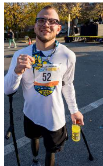
Everyone is welcome.