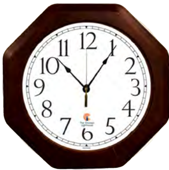
12" Octagon Arabic