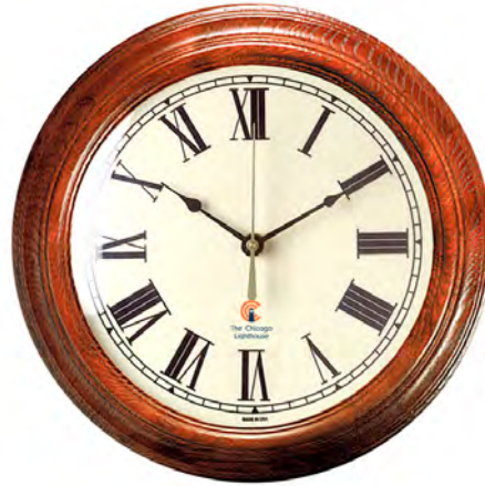
16" Round Roman