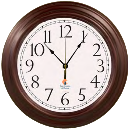
16" Round Arabic