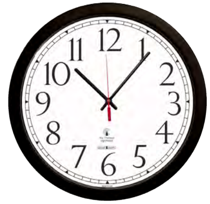
Daylight Savings Self-Set