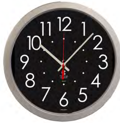
High Contrast Dial