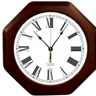
12" Octagon Roman