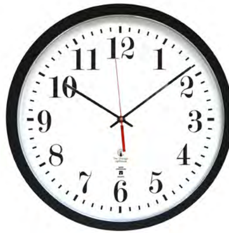
Atomic Radio Controlled