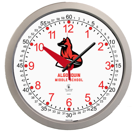
Teaching Clock (Shown with Customized clock face)