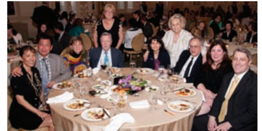
Board members and guests of The North Suburban Healthcare Foundation are shown at the Lighthouse's annual dinner in May.

The Chicago Lighthouse thanks The North Suburban Healthcare Foundation for their generous gift!