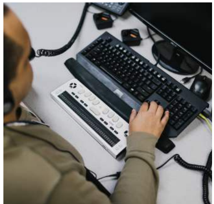
Screen reading software and Braille keyboard