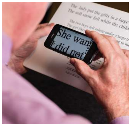
Hand held magnifiers