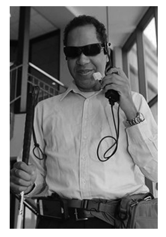
Figure 1. The BrainPort V100 device as worn by a user.

To operate the device, the user employs simple head movements to guide the camera to a scene of interest. The camera captures the scene as a greyscale digital image and forwards the image to the controller for processing. The visual information is then transmitted to the dorsal surface of the tongue via electrotactile stimulation patterns representative of the camera image (see Figure 2). The image is digitized to 400 pixels; in the standard setting, white pixels are felt as strong stimulation, grey pixels as medium-strength stimulation, and black pixels as no stimulation.