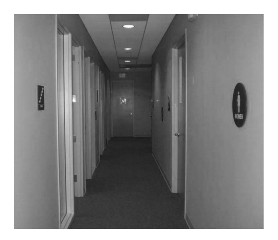
Figure 5. O&M task: participants were instructed to ambulate towards and touch the target signs.

sitioned on the walls at varying heights based on different configurations of hallways across study sites (see Figure 5). The distances of the signs from the starting point were specified, so that the measurement was consistent across all sites. One randomized pass-or-fail trial was conducted in which participants were given 10 minutes to locate and navigate toward the target sign using only the BrainPort. Participants were not permitted to use any other assistive device during this