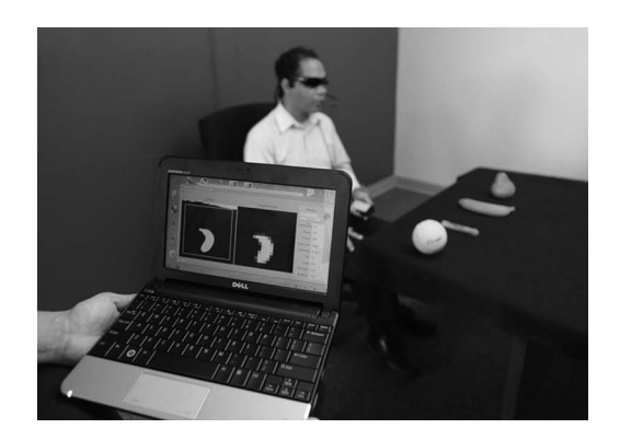
Figure 3. vRemote presentation of a camera view of a banana alongside the corresponding IOD image.

Following in-clinic training, participants were required to use the device in their everyday environments during daily activities for a minimum of 300 minutes per month for 12 months. They were asked to provide a log of the activities performed at home and the number of minutes spent on each activity. Written and computer-accessible instructions for device cleaning, storage, and safety were provided to each participant. To calculate usage time, the device internally logged the cumulative number of minutes the simulation was active (exceeding a simulation level of zero). Participants were provided with flashcards containing letters and words, copies of the signs used in the O&M task, playing cards, and tic-tac-toe boards to play on with a companion at home. Research staff members phoned participants monthly to address questions and document adverse events.