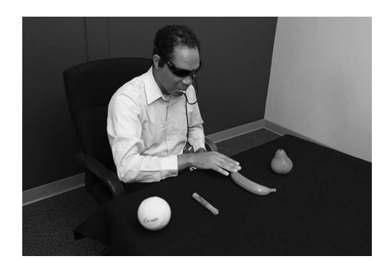
Figure 4. A user demonstrating the objectrecognition task. The user was instructed to locate a specific object using the BrainPort V100 device and to reach out to and touch the object without touching any other.

The O&M task was organized in a 15foot hallway. Four signs that are commonly located in public places were po-