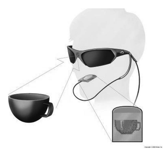
Figure 2. Illustration of the BrainPort V100 concept.